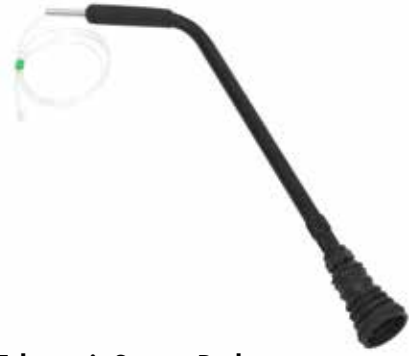
Telescopic Survey Probe