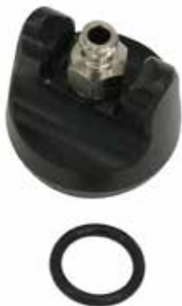
Filter Cap Assembly with "O" Rings