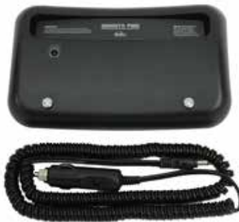
Hot Swap Vehicle Battery Assembly