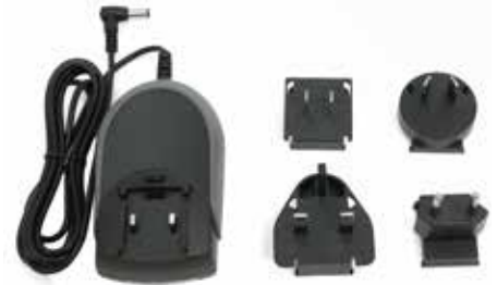
Universal Wall Plug Adapter