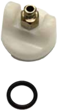
Filter Holder Knob Assembly