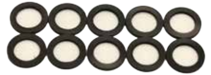
Hydrophobic Filter Ring Assembly (10 Pack)