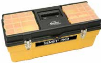
Compact Carrying Case with Foam