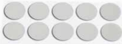
Hydrophobic Filter Disc 0.75" (10 Pack)