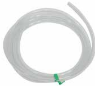
Telescopic Survey Probe Hose Assembly