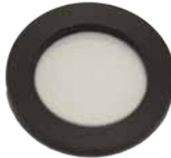
Filter Ring Assembly