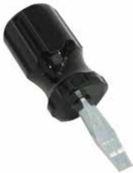
Battery Door Removal Tool