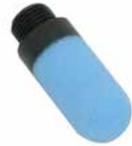
Telescopic Survey Probe Filter

External Hose Assembly for Telescopic Probe. Probe Not Included.