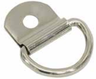
Clip D Ring