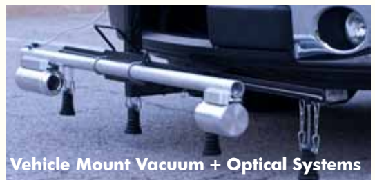
Vehicle Mount Vacuum + Optical Systems