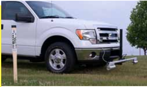
Ready for road and off-road surveys.