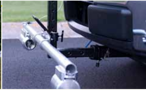
Designed for easy installation and portability.