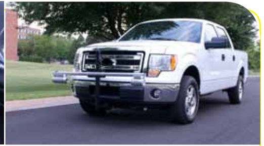
Adjustable height for safe driving speeds.