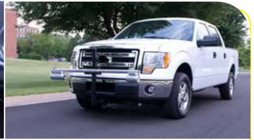
Adjustable height for safe driving speeds.