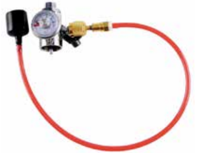
Regulator with Cal. Cupule Assembly

Use with 21 & 221 Liter Calibration Gas Cylinders