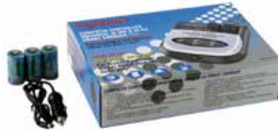
Battery Charger with Batteries