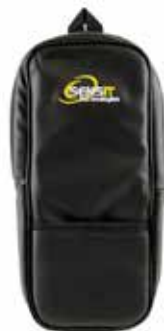
Soft Carrying Pouch