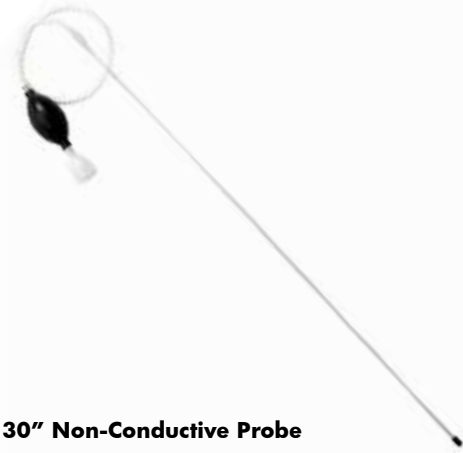
30" Non-Conductive Probe