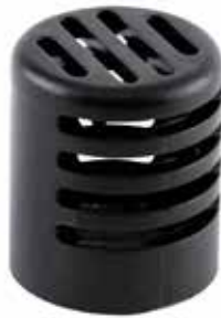
Sensor Cap without Filter Disc