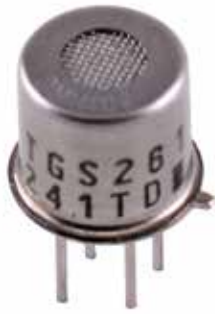
Sensor EX (LEL) (2611 Silver 4 Prong)