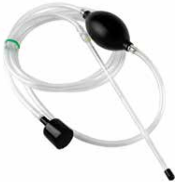
Aspirated Probe Assembly