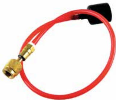
Cal Cupule Assembly

Use with 21 & 221 Liter Calibration Gas Cylinders