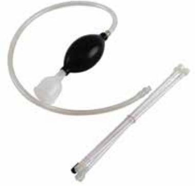
3 Piece 29" Non-Conductive Probe