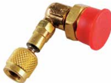
221 Liter Adapter (Use With 880-00032)