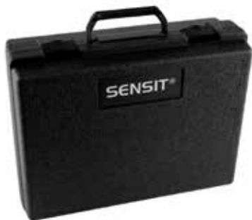
Hard Carrying Case

Part # 750-00023 - UL Version Part # 750-00024 - ATEX