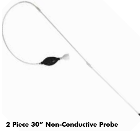
2 Piece 30" Non-Conductive Probe