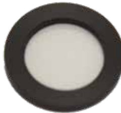
Filter Ring Assembly