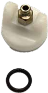
Filter Holder Knob Assembly