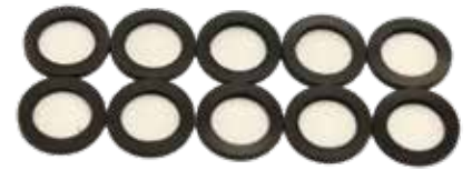
Hydrophobic Filter Ring Assembly (10 Pack)