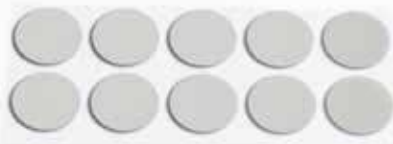
Hydrophobic Filter Disc 0.75" (10 Pack)