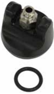
Filter Cap Assembly with "O" Rings