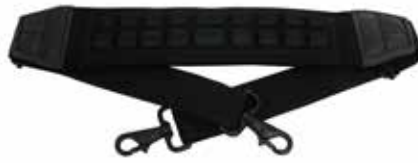
Shoulder Strap (Carrying)