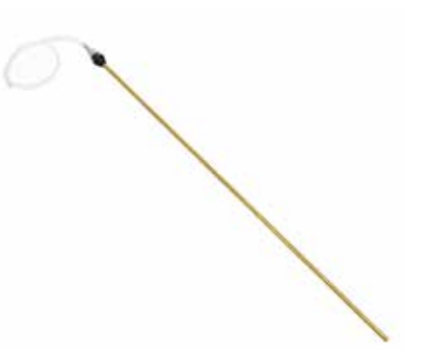
30" Brass Bar Hole Probe (5/16 OD) with Hose Assembly