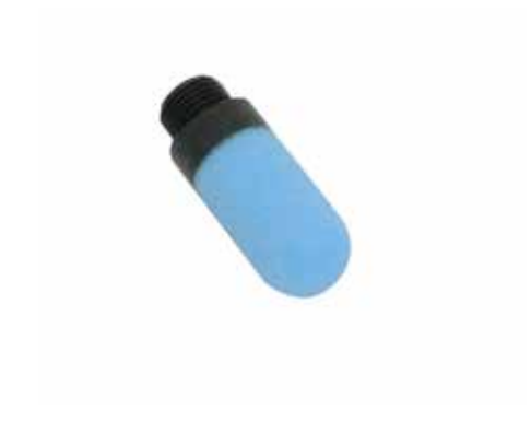
Telescopic Survey Probe Filter

External Hose Assembly for Telescopic Probe. Probe Not Included.