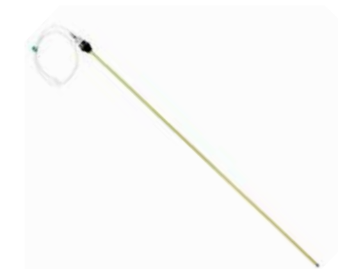
32" Heavy Duty Fiberglass Bar Hole Probe with Hose Assembly