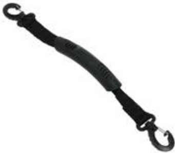
Instrument Handle Strap