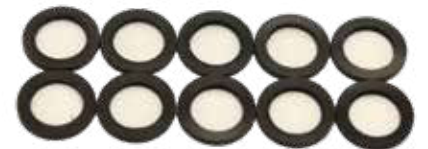
Hydrophobic Filter Ring Assembly (10 Pack)