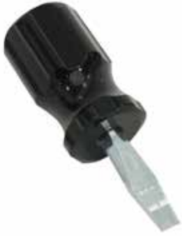
Battery Door Removal Tool