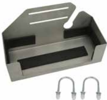
Vehicle Floor Mount For PMD