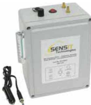
External Auxilliary Pump "6 Liter"