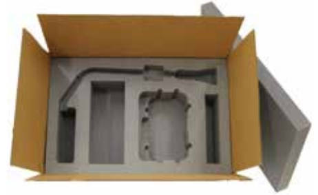
Ship Box w/foam (no case)