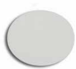
PMD Hydrophobic Filter Disc 1" (Single)