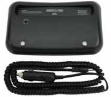
Hot Swap Vehicle Battery Assembly