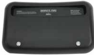
Lithium Rechargeable Battery Pack