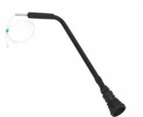
Telescopic Survey Probe