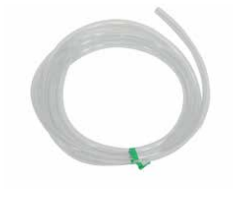
Telescopic Survey Probe Hose Assembly