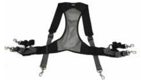
PMD Harness Hardware Kit