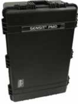
Deluxe Hard Carrying Case