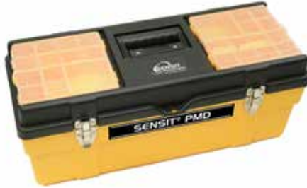
Compact Carrying Case