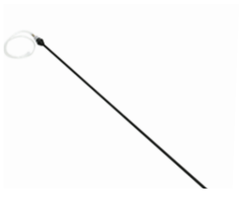
32" Fiberglass Bar Hole Probe with Hose Assembly