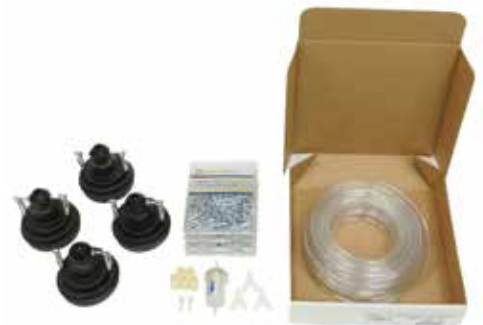
Vehicle Sampling Kit Boots

Part # 870-00053 (4" Boots) Includes Boots, Tubing, & Hardware