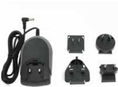
Universal Wall Plug Adapter