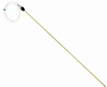
32" Heavy Duty Fiberglass Bar Hole Probe With Hose Assembly