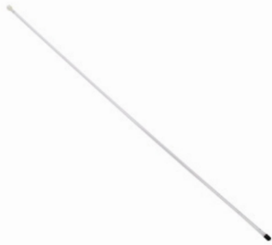
30" Polycarbonate Bar Hole Probe No Hose Assembly