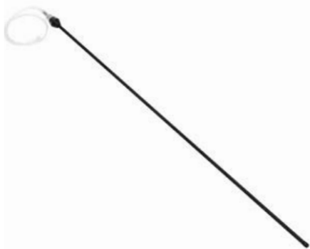
32" Fiberglass Bar Hole Probe With Hose Assembly