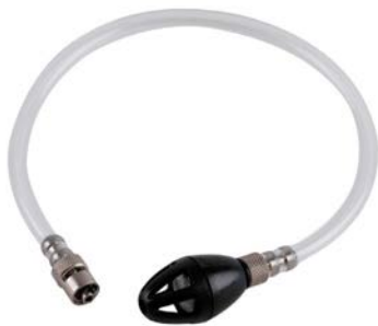
Leak Survey Drag Tube Assembly Part # 874-00001