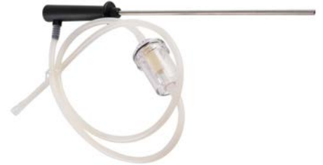
Hot Air Probe (Flue Gas) Part # 883-00023