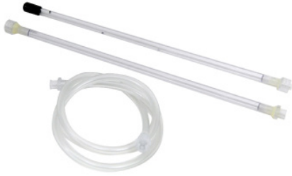
2 Piece Polycarbonate Probe Assembly With Hose Assembly