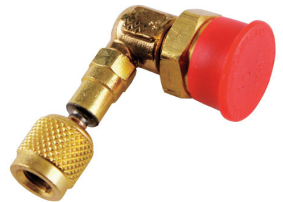
221 Liter Adapter (Use With 880-00032)

Use with 21 & 221 Liter Calibration Gas Cylinders