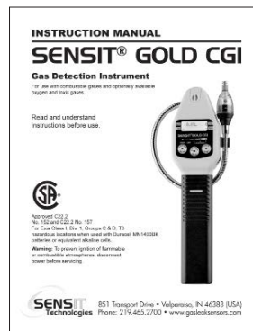
Instruction Manual - CSA