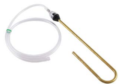
Purge Probe (Brass) With Hose Assembly