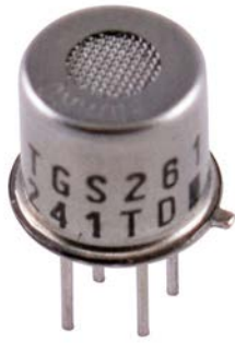
Sensor EX (LEL) (2611 Silver 4 Prong)