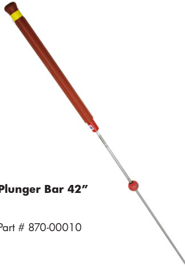
Plunger Bar 42" Part # 870-00010