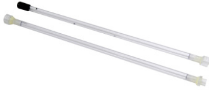
2 Piece Polycarbonate Probe Assembly No Hose Assembly