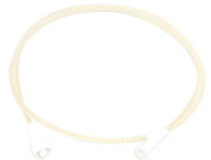
Nafion Cal Adapter