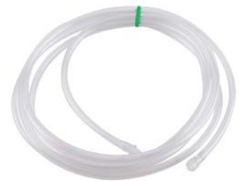
10' Extension Tubing For Confined Space Probe Part # 883-00050