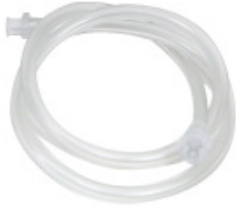
Hose Assembly (24") For Brass, Fiberglass, Heavy Duty Probe Part # 883-00051