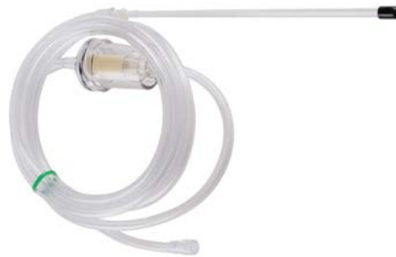
Confined Space Probe (10') With Hose Assembly Part # 883-00015