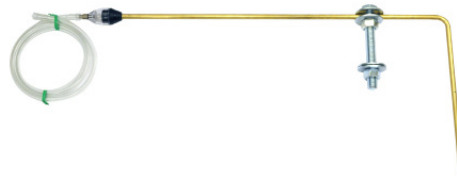
Flange Purge Probe Part # 883-00105

For additional parts not shown, contact customer service.