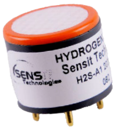
Sensor H2S (Hydrogen Sulfide)*

Repair Certification is required to purchase and replace this sensor.