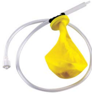
Balloon "T" Assembly (Bump Test Adapter)