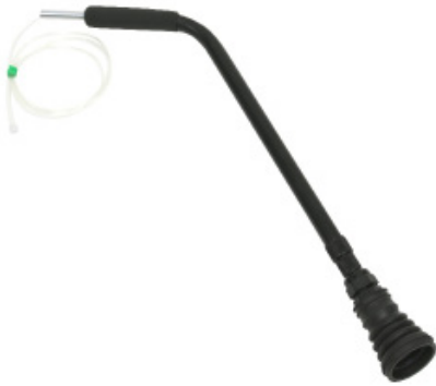
Telescopic Survey Probe Part # 883-00086