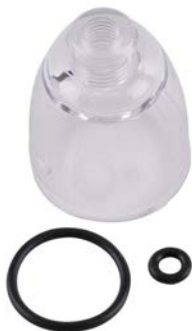
Sensor Cap with "O" Rings (Single)

Contact Customer Service for additional information.