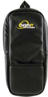
Soft Carrying Pouch