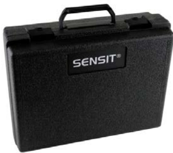
Hard Carrying Case