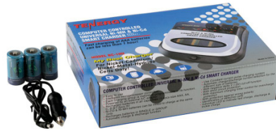
Battery Charger with Batteries