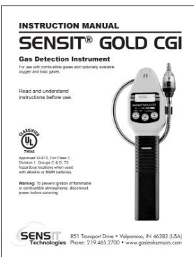
Instruction Manual - UL