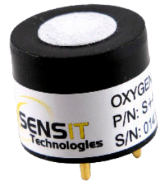
Sensor O2 (Oxygen)*

Repair Certification is required to purchase and replace this sensor.