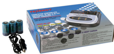
Battery Charger with Batteries