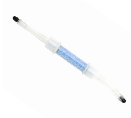
Moisture Filter Tube