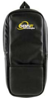
Soft Carrying Pouch