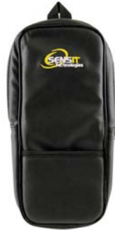
Soft Carrying Pouch