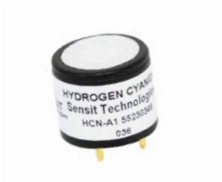
Sensor HCN (Hydrogen Cyanide)*