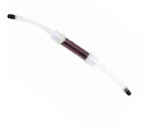
Permanganate Filter (Single)