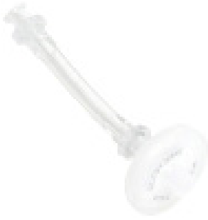
External Hydrophobic Filter