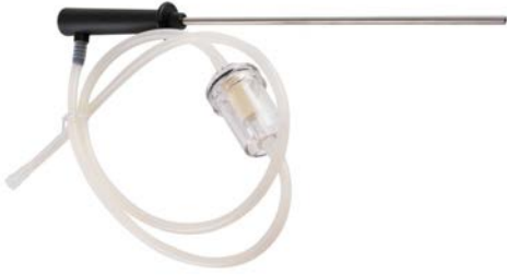
Hot Air Probe (Flue Gas)