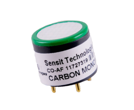
Sensor CO (Carbon Monoxide)*

Repair Certification is required to purchase and replace this sensor.