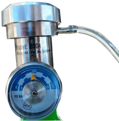
Demand Bottle Regulator

Use with 34, 58, 103, 116 Liter Cal Gas Cylinders