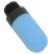
Telescopic Survey Probe Filter

External Hose Assembly for Telescopic Probe. Probe Not Included.