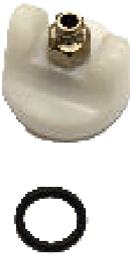
Filter Holder Knob Assembly