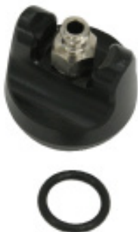
Filter Cap Assembly with "O" Rings