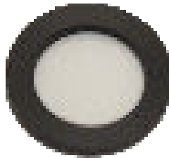
Filter Ring Assembly