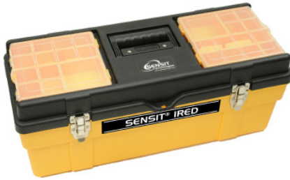
Compact Carrying Case with Foam