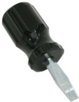
Battery Door Removal Tool