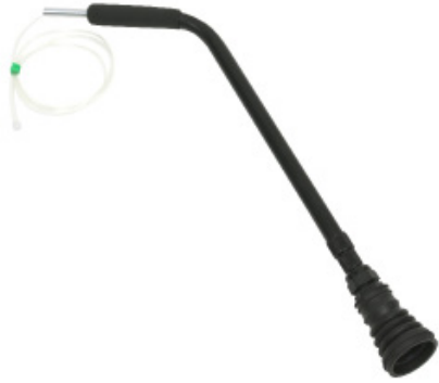
Telescopic Survey Probe