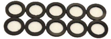
Hydrophobic Filter Ring Assembly (10 Pack)