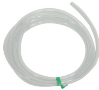
Telescopic Survey Probe Hose Assembly