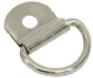
Clip D Ring