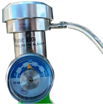
Demand Bottle Regulator