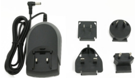
Universal Wall Plug Adapter