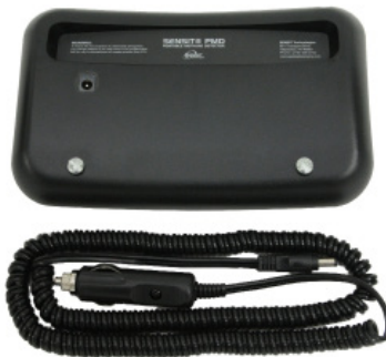
Hot Swap Vehicle Battery Assembly