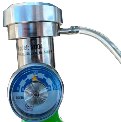
Demand Bottle Regulator