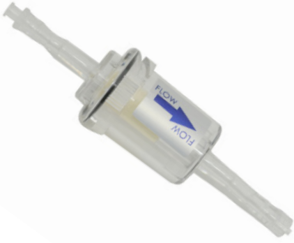
Dirt and Water Filter Assembly