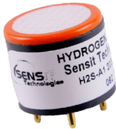
Sensor H2S (Hydrogen Sulfide)*

Repair Certification is required to purchase and replace this sensor.