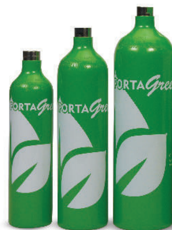
34 Liter 58 Liter 103 Liter