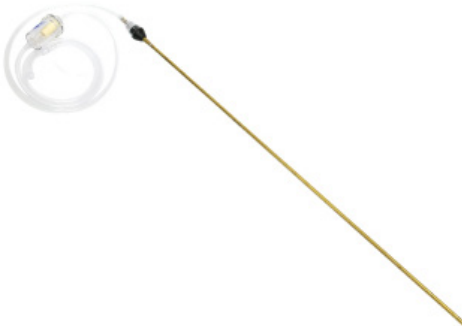
30" Brass Bar Hole Probe (1/4 OD) With Extra Inline Filter and Hose Assembly