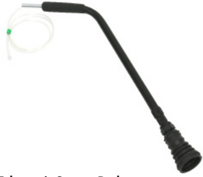
Telescopic Survey Probe