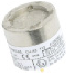
LEL (EX) Pellistor Sensor*