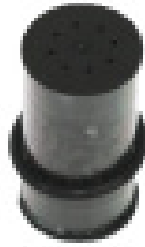
Inline "Mini" Hydrocarbon Filter Kit

This can be used in the place of long tube style hydrocarbon filter or if customer does not own/use a fiberglass or brass probe.