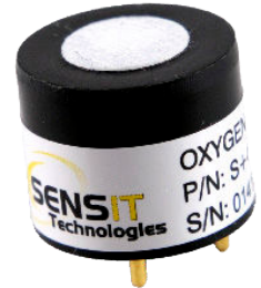
Sensor O2 (Oxygen)*

Repair Certification is required to purchase and replace this sensor.