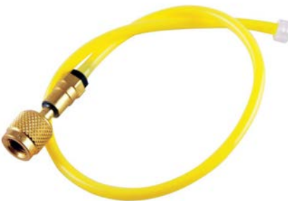
Adapter Assembly Only

Use with 21 & 221 Liter Calibration Gas Cylinders