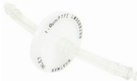
External Large Filter Assembly