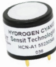
Sensor HCN (Hydrogen Cyanide)*

Repair Certification is required to purchase and replace this sensor.