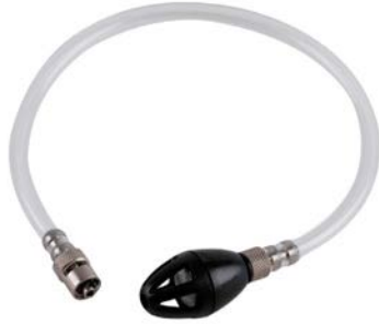
Leak Survey Drag Tube Assembly