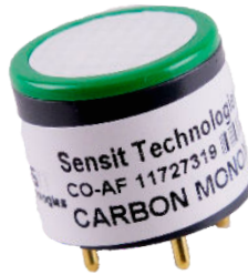
Sensor CO (Carbon Monoxide)*

Repair Certification is required to purchase and replace this sensor.