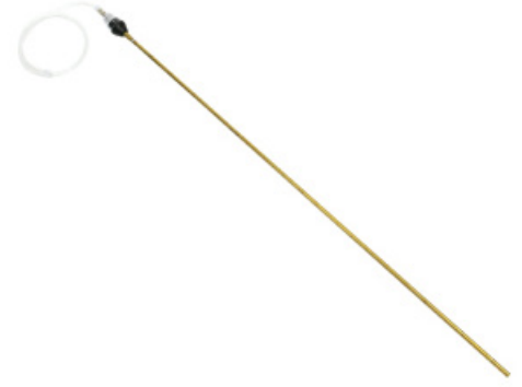
30" Brass Bar Hole Probe (1/4 OD) With Hose Assembly