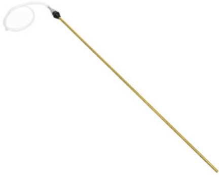
30" Brass Bar Hole Probe (5/16 OD) With Hose Assembly