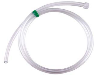
Cal. Adapter Assembly

Use with 34, 58, 103, 116 Liter Cal Gas Cylinders