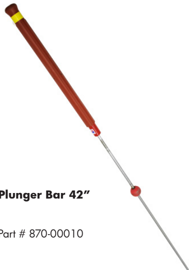
Plunger Bar 42"