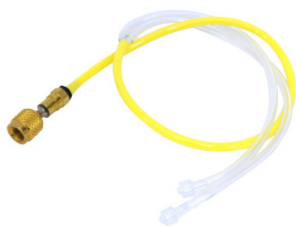
Adapter Assembly for Smart-Cal

Use with 21 & 221 Liter Calibration Gas Cylinders