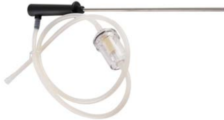
Hot Air Probe (Flue Gas)