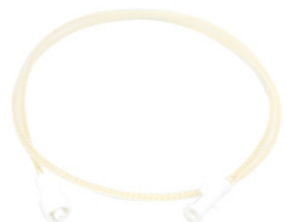
Nafion Cal Adapter