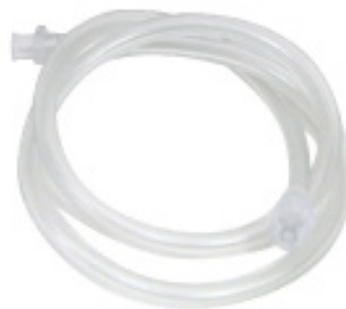
Hose Assembly (60") For Brass, Fiberglass, Heavy Duty Probe