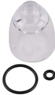
Sensor Cap with "O" Rings (Single)

Part # 870-00018 Part # 870-00019 (6 Pack)