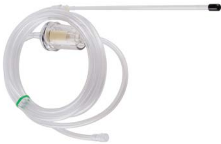
Confined Space Probe (10') With Hose Assembly