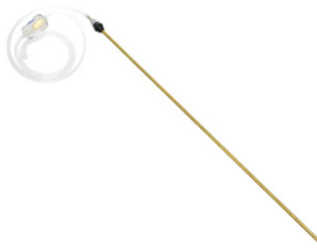
30" Brass Bar Hole Probe (5/16 OD) With Extra Inline Filter and Hose Assembly