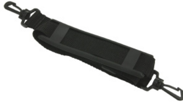
Shoulder Strap For Carry Pouch