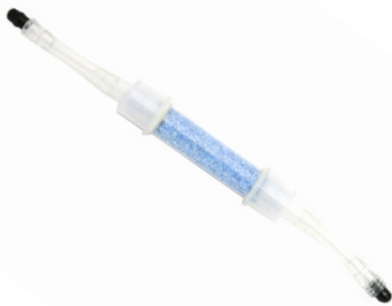
Moisture Filter Tube

For "acid gases" like Sulfur based, SO 2 , NO 2 , HCN, H 2 S