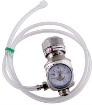
Regulator With Cal. Adapter Assembly