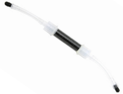
Hydrocarbon Filter Kit