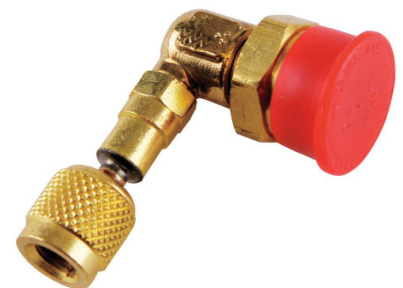
221 Liter Adapter (Use With 880-00032)

Use with 21 & 221 Liter Calibration Gas Cylinders