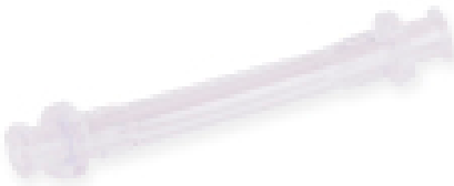
Pigtails for Trak-It IIIa Calibration