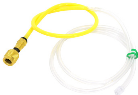
Adapter Assembly for Smart-Cal

Use with 21 & 221 Liter Calibration Gas Cylinders