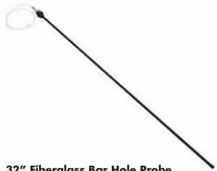
32" Fiberglass Bar Hole Probe With Hose Assembly