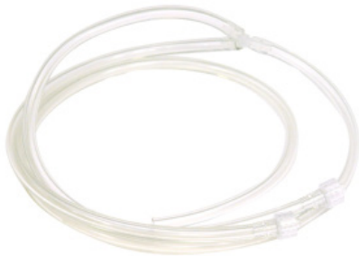
Adapter Assembly for Smart-Cal

Use with 34, 58, 103, 116 Liter Cal Gas Cylinders