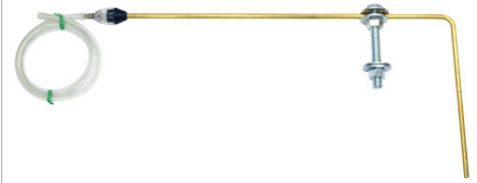
Flange Purge Probe