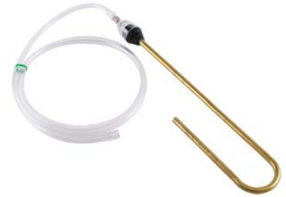
Purge Probe (Brass) With Hose Assembly