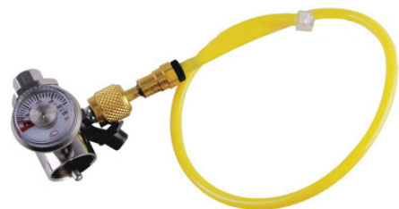
Regulator With Cal. Adapter Assembly

Use with 21 & 221 Liter Calibration Gas Cylinders