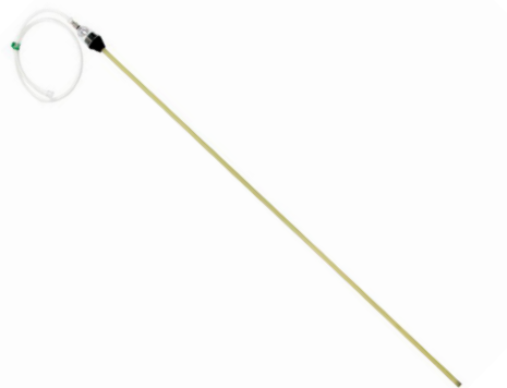
32" Heavy Duty Fiberglass Bar Hole Probe With Hose Assembly