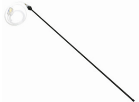
With Extra Inline Filter and Hose Assembly