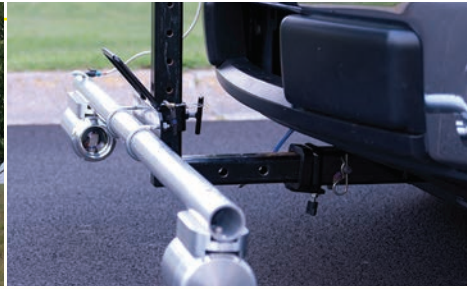
Designed for easy installation and portability.