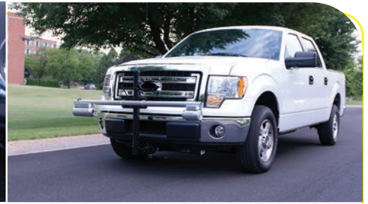
Adjustable height for safe driving speeds.