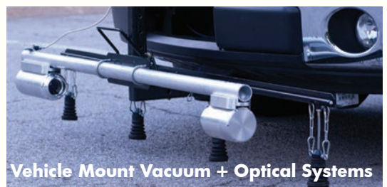
Vehicle Mount Vacuum + Optical Systems