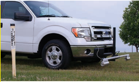
Ready for road and off-road surveys.