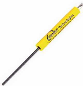
3/32 Hex #1 Phillips Tool

Repair Certification is required to purchase and replace this pump.