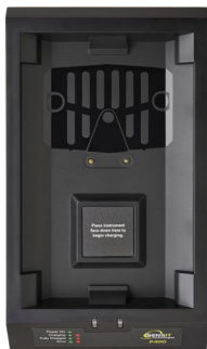
P400 Charging Station