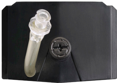
Calibration Cup Assembly

Use with 34, 58, 103, 116 Liter Cal Gas Cylinders