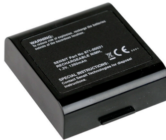
NiMH Battery Pack