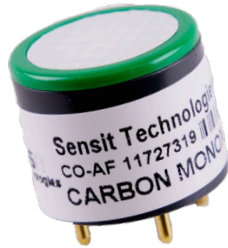
Sensor CO (Carbon Monoxide)*

Repair Certification is required to purchase and replace this sensor.