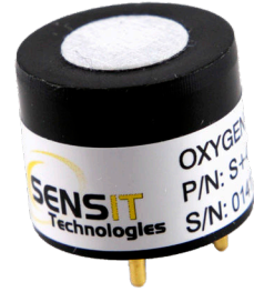
Sensor O2 (Oxygen)*

Repair Certification is required to purchase and replace this sensor.