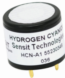
Sensor HCN (Hydrogen Cyanide)*

Repair Certification is required to purchase and replace this sensor.