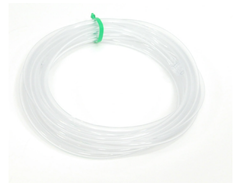
10' Hose Assembly