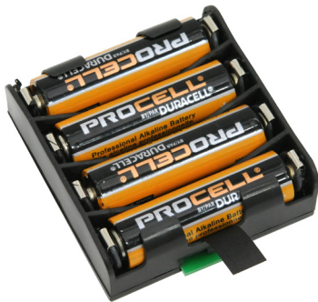
Alkaline Battery Pack Replacement

1/8" ID 1/4" OD, Probe, (1) Male & (1) Female Luer