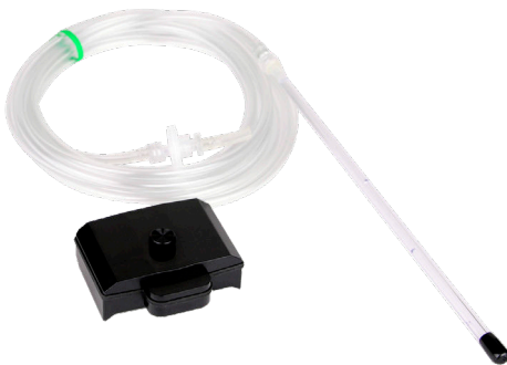
Motorized Pump Kit