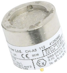
LEL (EX) Pellistor Sensor*