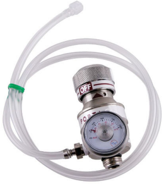
Regulator With Cal. Adapter Assembly