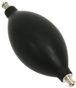
Hand Aspirator Bulb Assembly

Includes: (14" 3/16" ID 5/16" OD Tubing, Aspirator Bulb, (1) Male Luer, (1) Female Luer)