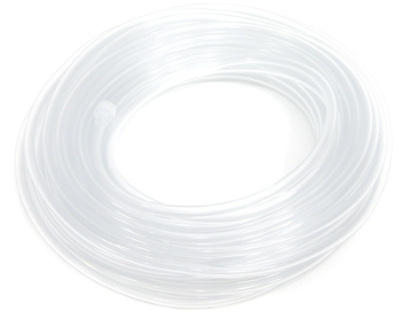
50' Extension Hose