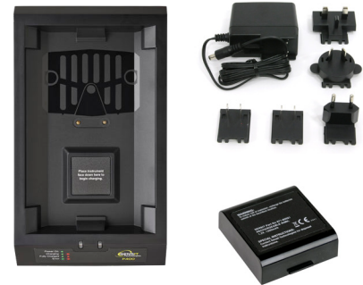
Charger with NiMH Battery Pack