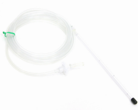
10' Hose with Filter Inlet