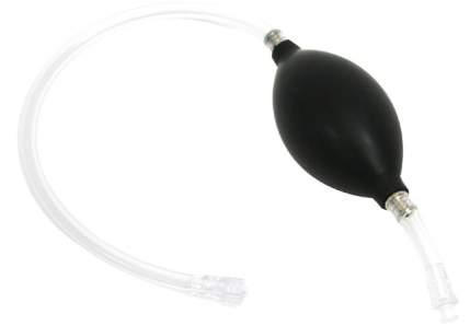
Hand Aspirator Bulb Assembly

Includes: Calibration Cup Assembly, Hand Aspirator and Hose Assembly