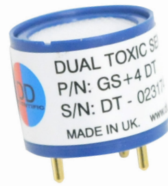
Dual Toxic CO/H2S*

Repair Certification is required to purchase and replace this sensor.