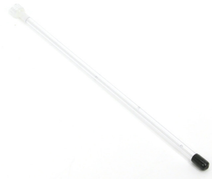
Probe Assembly 10" (Polycarb) Tubing not included