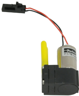
Pump (Internal Replacement)*

Repair Certification is required to purchase and replace this sensor.