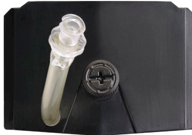
Calibration Cup Assembly