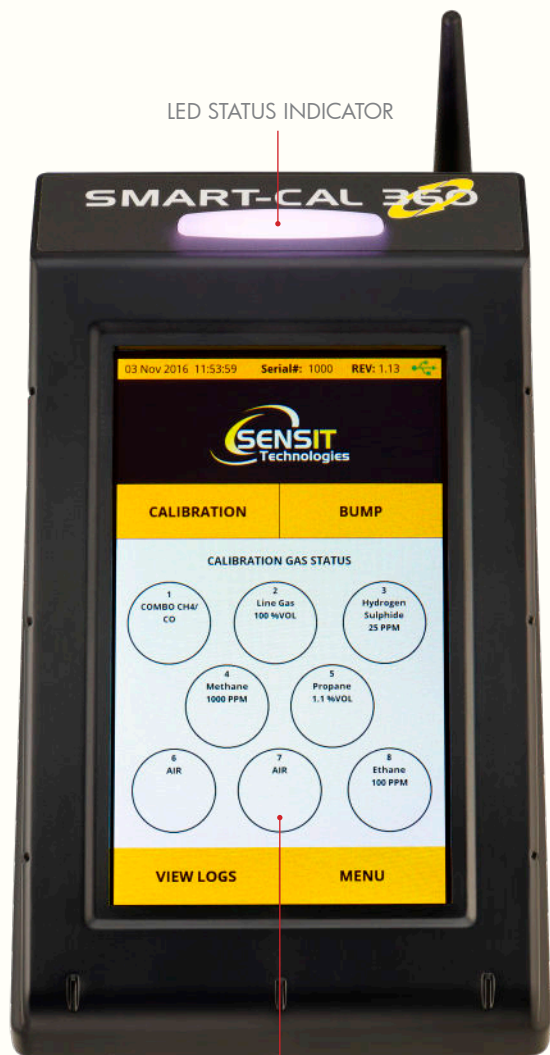
7 INCH TOUCH SCREEN