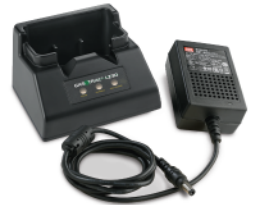
Charging Kit with Power Supply Part # 871-000?? For IS Units