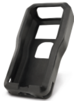
Protective Boot Part # 870-00098