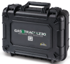
Hard Carrying Case with Foam Part # 872-00035