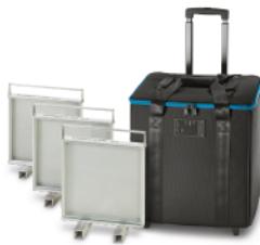
Training Cells with Case Part # 882-00161