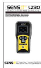
Instruction Manual Part # 750-00096