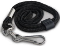
Wrist Strap Part # 360-00040